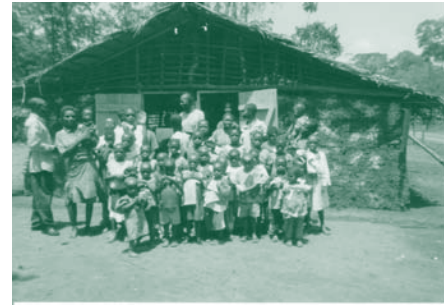
Pygmy children in front of temporary school.

The primary school started last year continues with 37 kids in first and second grades. The children range in age from 4 to 15 and for the first time in their lives have an opportunity to get a basic education.