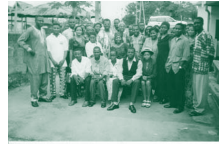
With Christian Students at University of Yaounde II, SOA