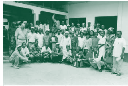
Church leaders participate at the morning meetings, during first Tombel crusade.

We held a pastors and leaders conference in Tombel, as a follow up of the crusade, from April 16th thru 19th on the Theme: "Building according to pattern." (Hebrew 8:5b). Some of the topics were: "Building According to Pattern", "Developing Kingdom Mentality", "The Jerusalem Prototype", "The Antioch Prototype," Natural Church growth" "the Pastor and His family." etc, etc. Because of the response and the need, we are planning other conferences like this for pastors in other rural areas who have never had the privilege of receiving formal training.