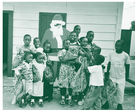
Father Christmas (Santa) comes to town

Christmas always brings opportunities to demonstrate Christ's love in a different way. This year, we will be looking at ways of reaching out to our community, possibly, through Prison outreach. Below are pictures from a previous Christmas when we teamed up with staff of the US Embassy in Yaounde to take gifts to children of an orphanage in the city.