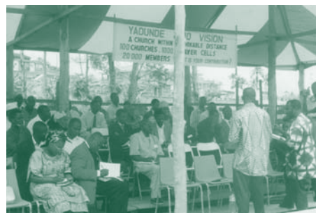
Yaounde, April 2003; Teaching indigeneous church leaders on "Natural Church Growth."