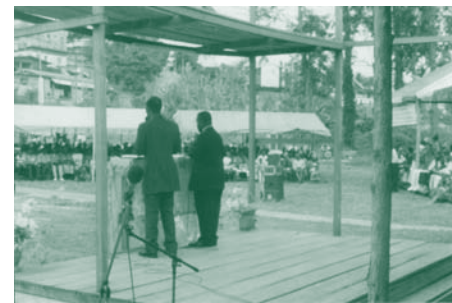
April 2003: Preaching on the "importance of Vision" and 2010 vision in Yaounde.